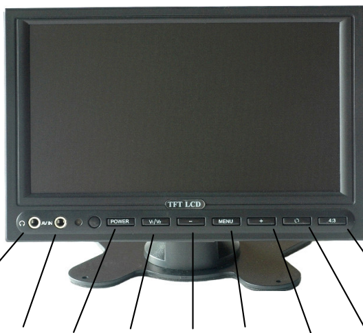
Headphones – AV IN – Power – V1/V2 – '+' Adjust – Menu – '-' Adjust – Picture - Aspect

Thank you for purchasing this LCD colour monitor which is suitable for connection to reversing cameras, or to DVD players or other video equipment.